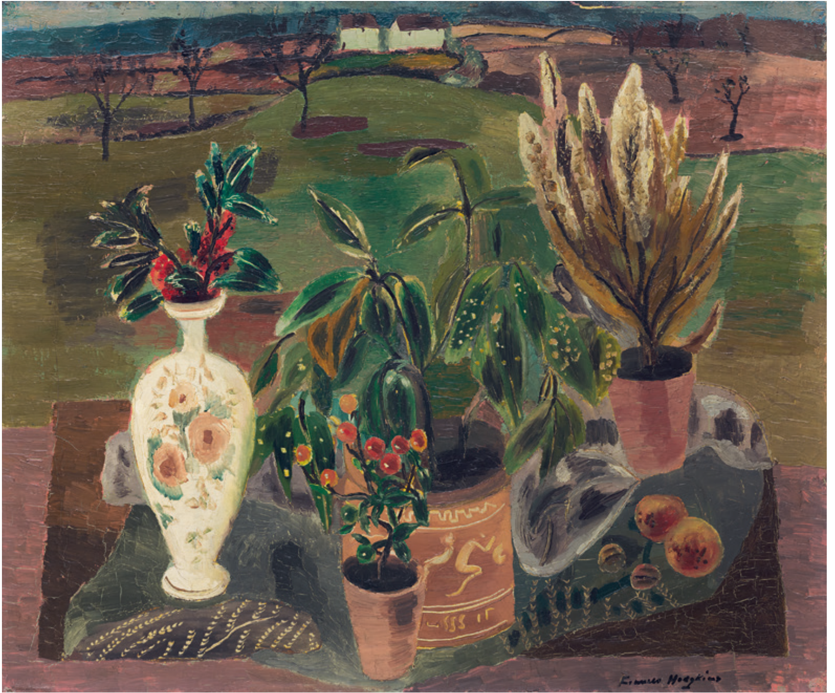
FIGURE 2.12 Berries and Laurel , c. 1930