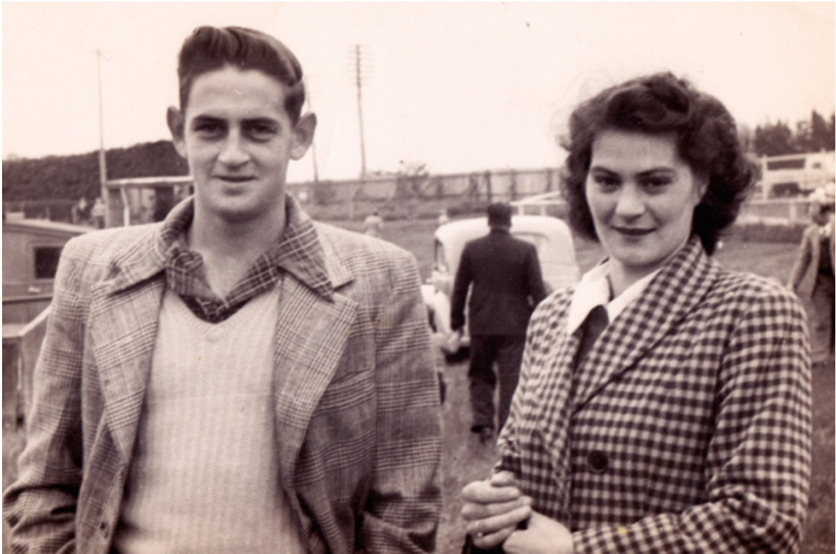
Mika's mother and father courting in the 1950s.

The family photo is also quintessentially Timaru – from Te Maru (meaning 'place of shelter') – where (as I write this) the mayor has just declared war on the rest of Southland for the cheese roll title. 6 As a convenient stopover on the drive between Christchurch and Dunedin, Timaru can seem to the casual traveller like the land that time forgot. A beautiful ocean view, with a summer carnival on the