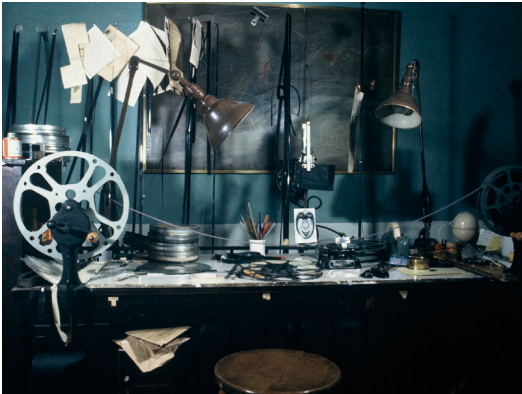
ABOVE Lye's work bench for making films in the 1950s. BELOW Some of the stencils he used to make hand-painted films in the 1930s.