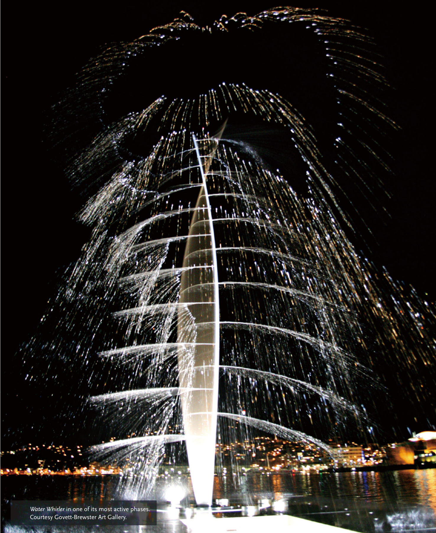
Water Whirler in one of its most active phases.