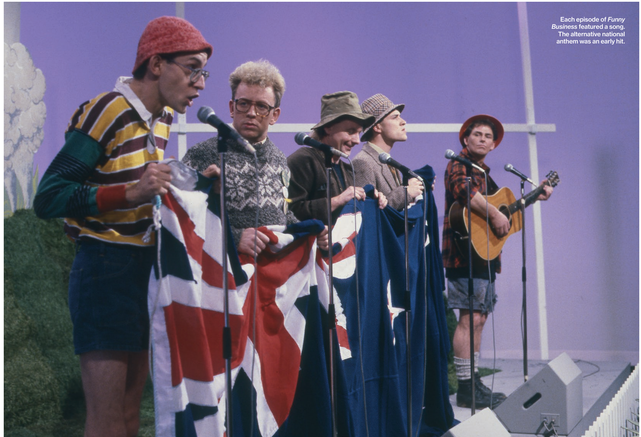
Each episode of Funny Business featured a song. The alternative national anthem was an early hit.

But for stand-ups the 1980s was the time of the talent quest. This was a time-honoured format: performers work for free and if a prize is offered, there will always be someone prepared to try their luck. In the 1980s, it was a simple first step for promoters who had never originated shows and for audiences who were still adapting to live comedy. The idea was to flush out the stars of tomorrow and make careers overnight. But as this