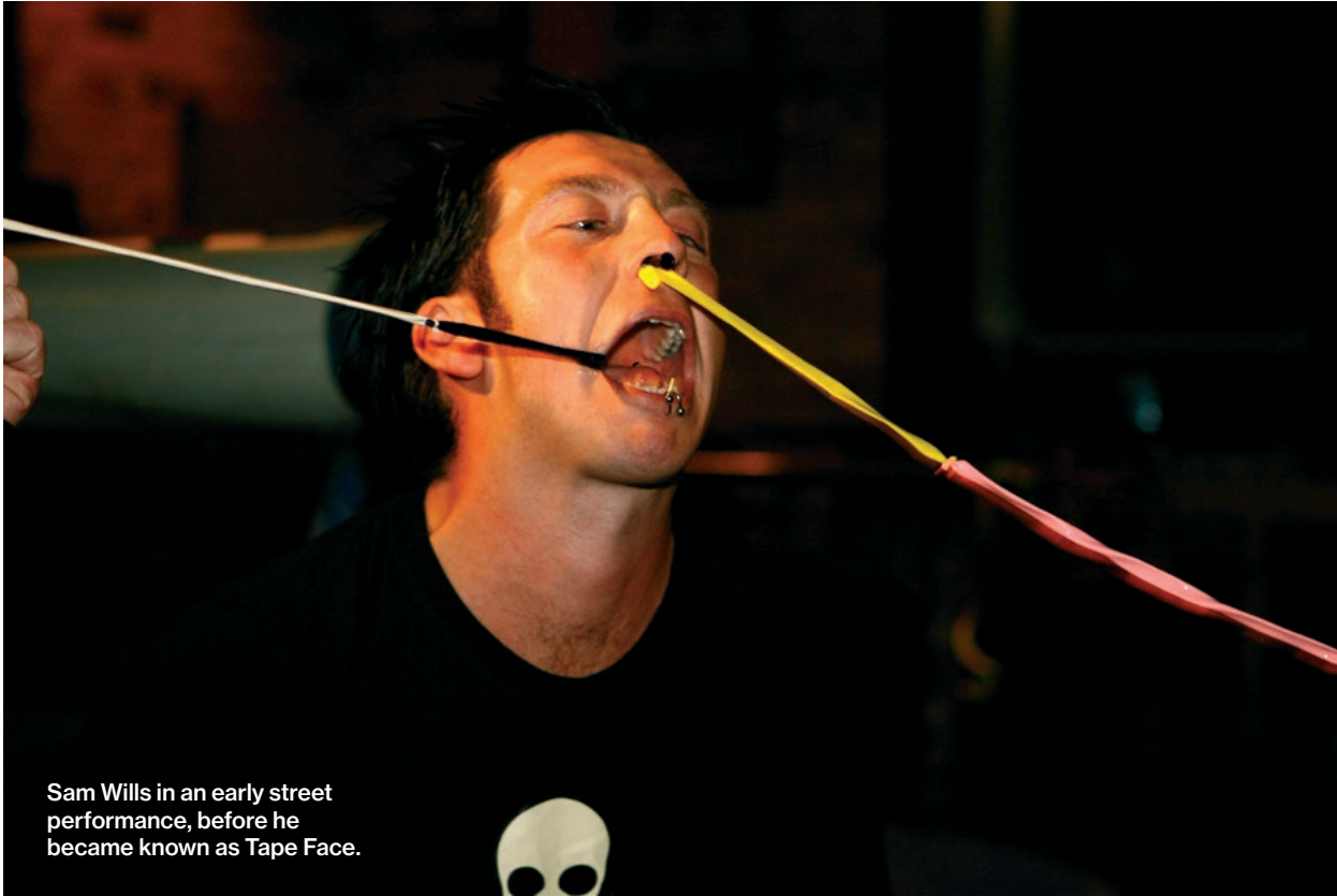
Sam Wills in an early street performance, before he became known as Tape Face.

In 1995 the first independent stand-alone comedy festival in Auckland had been rebranded Laugh, and it was expanding steadily. In the same year, Comedyfest created a gig called Pulp Comedy and mounted it at The Powerstation. It was a meaningful return to a landmark Auckland venue by local comedy – the venue that had seen the competitions of the late 1980s. But the difference was that local comedians were doing their own assured routines in their own festival to a crowd that had grown with them. It was the gig that told everyone stand-up had arrived, at a place that comedians had created themselves.