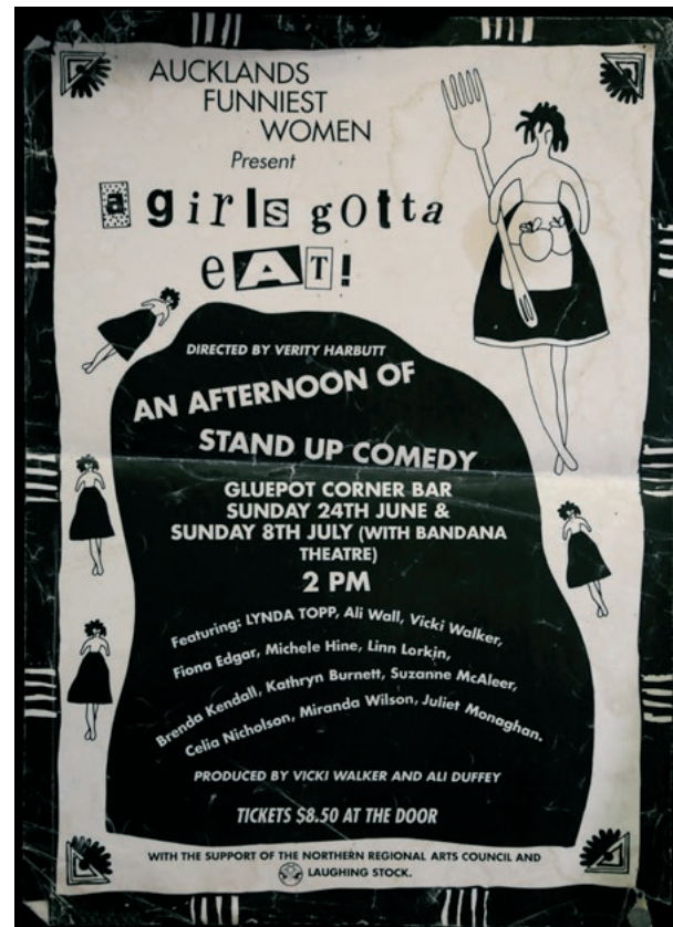
ABOVE Poster for the first Girls Gotta Eat show, 1990.

The first two-hour-plus show, directed by Mari Wilson from Inside Out Theatre, featured a stellar line-up from all over the Auckland performing