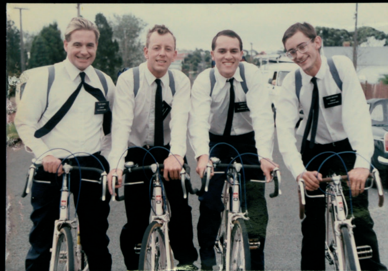
TOP Funny Business as The Hoons.