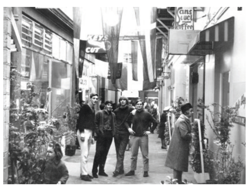
Two scenes from my student life in 1966 – on the way to protest LBJ's visit to Wellington in 1966 (above); and performing in a German-language play – my only ever theatrical performance (below).

During those years I spent the summer holidays earning money to help support myself during the year. At a time of low unemployment there was little difficulty finding labouring jobs, and I tended to move around sampling different experiences - one year as a postman on my bike, another on a building site, a time in a grain store carting large sacks, once in the Skellerup rubber factory packing the rubber rings which farmers used to castrate lambs, and in my last year driving a big truck for a Dutchman who would buy fruit and vegetables at the market in the early morning and then deliver them to dairies around Christchurch. The work was never too onerous, but what I gained was a close acquaintance with boys and men from other social circles. Most were from the working class and I became increasingly conscious, and at times embarrassed, by my own genteel background and assumptions. I enjoyed the banter and the teasing of my workmates. At Weir House I also began to notice how much more mature and self-directed were the boys from state schools. I realised that there was another world outside Fendalton and Christ's College and Hawke's Bay landholders. Inevitably such learnings affected my political attitudes.