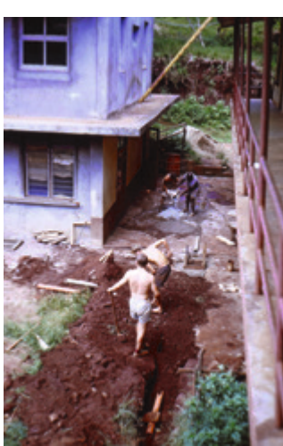
In New Caledonia in early 1967, we stayed in this beautiful village inland (left) and mixed concrete in the sun (right).

work was hard in the tropical heat, but I did enjoy the visit to another overseas culture. I took endless photographs of one especially beautiful village where we stopped one night. I saw Nouméa very much through the eyes of my previous French encounter – the city, I wrote home, is 'very much colonial France without the stink of history or the classical architectural beauty of the French town, but there is the same smell of rotting food, the same tree-lined "places", the same impressive cathedral dominating the town with its own highly continental courtyard, the same dogs barking at every corner, and the same hair-raising drivers'. So while I still had the travel bug, France and England were not the favoured destinations. A few years in the States, at a time when there seemed to be a feast of new ideas, plenty of good music to hear and excitingly different places to explore, began to appeal.